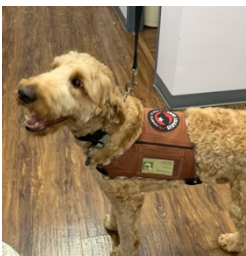
Jax-Facility Dog Wahiawa Health Center